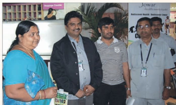
Smt. Panabaka Lakshmi, Hon'ble Union Minister of State for Textiles at Sorghum road-show

benefits were organized at "e-Coupal's super market outlets at Tadbund, Secunderabad (January 17, 2010), at Banjara Hills (January 24, 2010), at food bazaar, East Marredpally, at Chopal fresh. Barkatpura (January 31, 2010). These shows are aimed to create awareness about sorghum health benefits to the public and enhance the commercial value for millet products. Dr. DM Hegde,