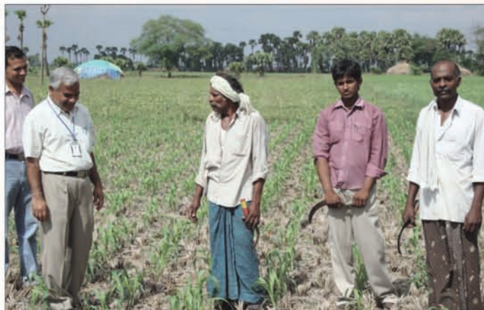
Performance of sorghum cultivars in rice fallows being monitored