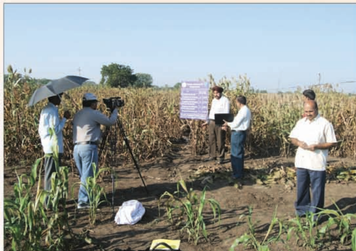
Video coverage of drought experiments at Bijapur

The digital video coverage of sequences relating to sorghum experimental plots evaluating stay green QTL introgression lines for post-drought tolerance was recorded at Bijapur in Karnataka and at Badnapur in Maharashtra during January 19-22, 2010. These experiments are conducted by Dr. HS Talwar in coordination with