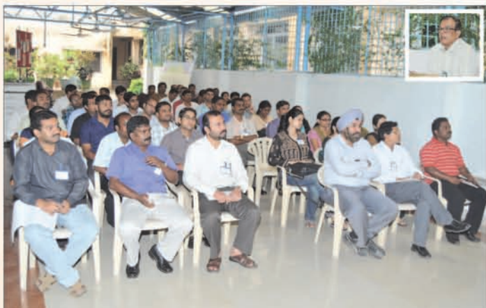
FOCARS trainees listening to the Director on DSR activities

Newly recruited 50 ARS scientists of ICAR belonging to 88 th batch of the FOCARS visited DSR on January 15, 2010. Director briefed