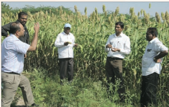
Sorghum breeder seed monitoring team inspecting the genetic purity

The breeder seed production fields were monitored on January 04,