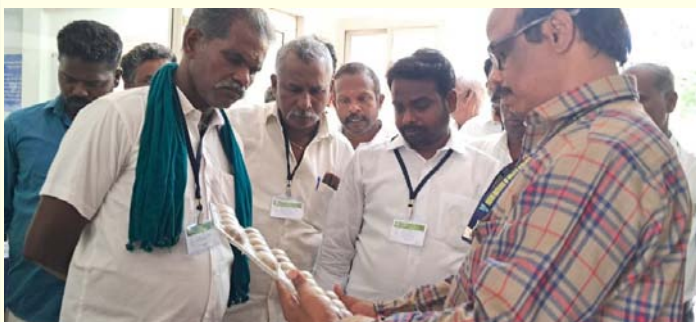
Millets Newsletter No. 237; July, 2023

Twenty progressive farmers of ATMA from Pudukottai district, Tamil Nadu from visited Millets Genebank on 4th July 2023.