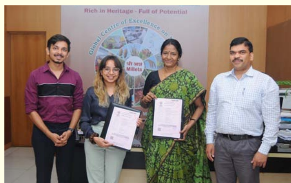
Indo-US Agriseeds Limited, Gujarat