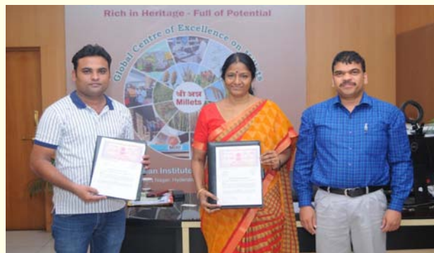
Millet Yards Pvt Ltd., Madhya Pradesh