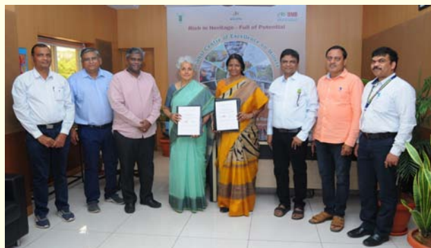
MS Swaminathan Research Foundation, Chennai