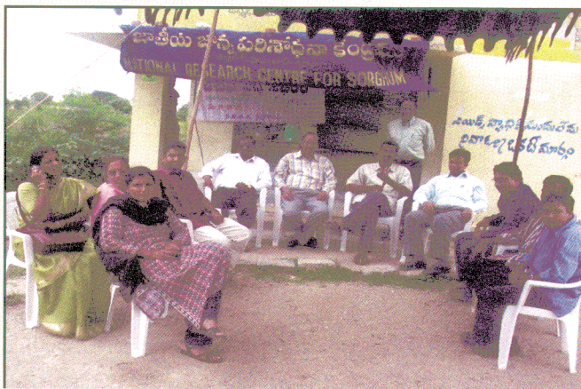
The scientific team from NRCS answering the queries made by the group of farmers and farm women