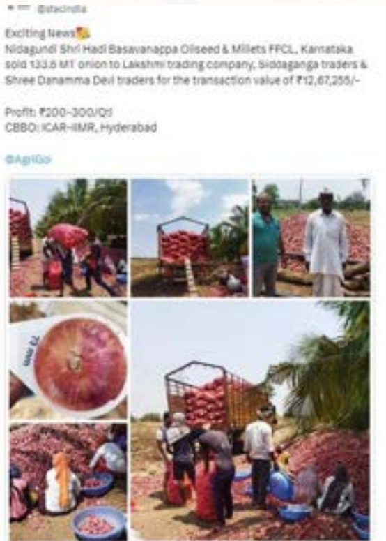
Mar 27, 2024 - 700 Views